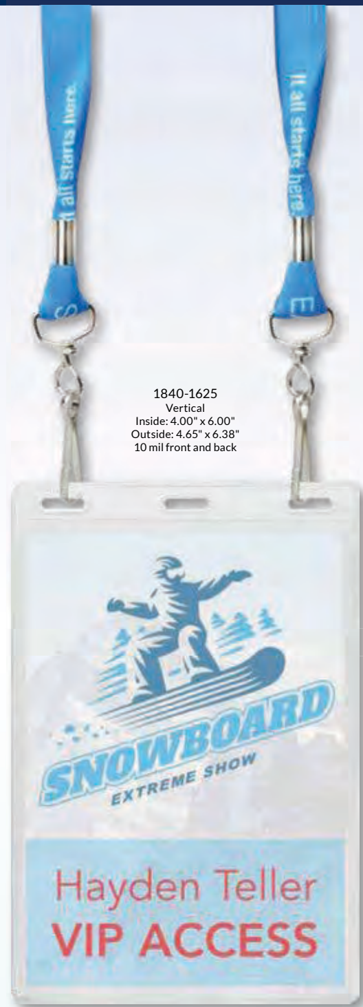
1840-1625 Vertical Inside: 4.00" x 6.00" Outside: 4.65" x 6.38" 10 mil front and back