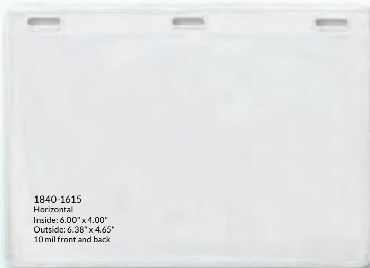
1840-1615 Horizontal Inside: 6.00" x 4.00" Outside: 6.38" x 4.65" 10 mil front and back