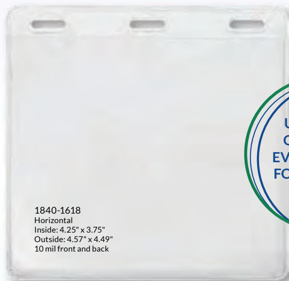
1840-1618 Horizontal Inside: 4.25" x 3.75" Outside: 4.57" x 4.49" 10 mil front and back