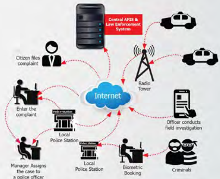
Fig: System Layout of M2SYS ABIS/AFIS