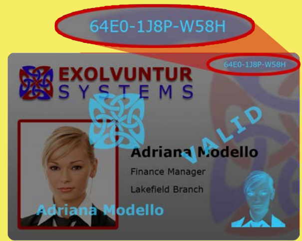
Closeup of Unique Machine Code

High resolution gradient UV printing is more cost-effective than custom holographic laminate and doesn't require additional hardware or expensive readers. It can be viewed with any normal UV flashlight.