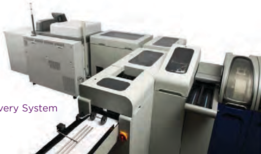
MXD610 Card Delivery System

Support market trends: Meet the growing vertical card trend without limiting job sizes based on card orientation. Dynamically place cards on carriers horizontally and vertically to meet customer requests.