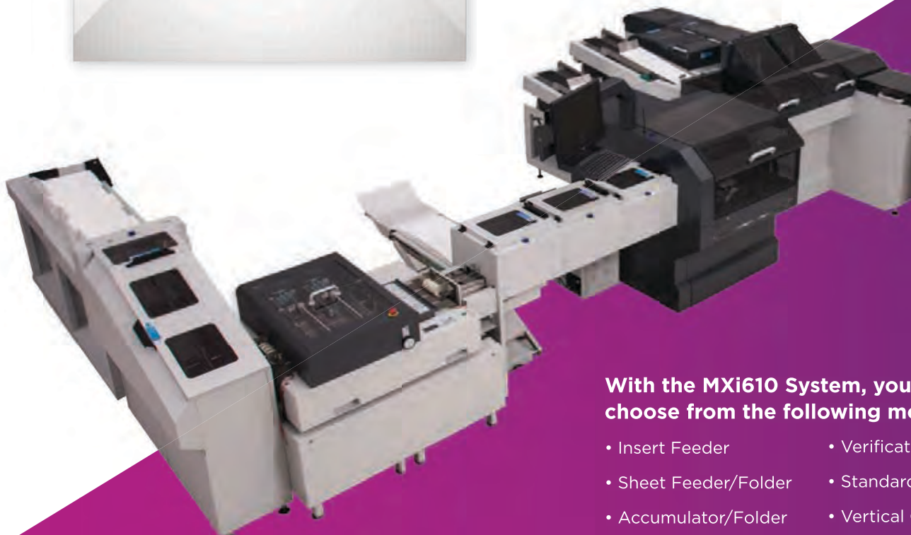
MXi610 Envelope Insertion System