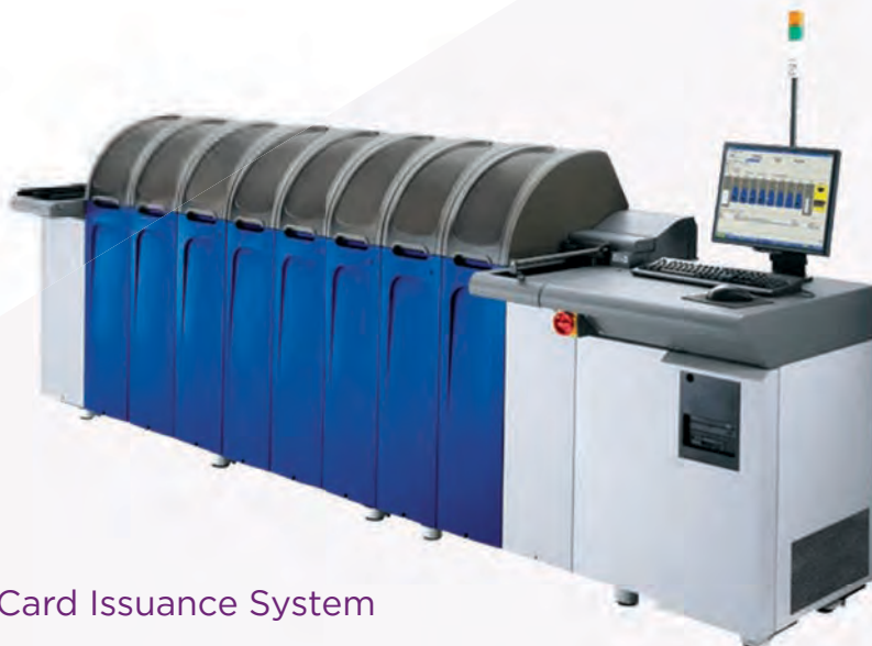
MX6100 Card Issuance System

Service and support: The MX Series Systems are supported by the industry's largest service and support network, which spans more than 150 countries worldwide. Online and phone support is available 24/7.