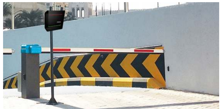
Parking Management: Comfortable access without waiting

The "Teach-In Mode" is used to teach the transponders to be accessed without the use of the software. If the reader is in this mode, all read transponders are automatically transferred to the access database.