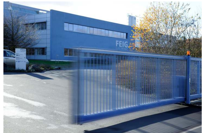
Perimeter Protection: Fast and safe access to industrial plants etc.

Suitable loop detectors and motion detectors are available from FEIG ELECTRONIC.