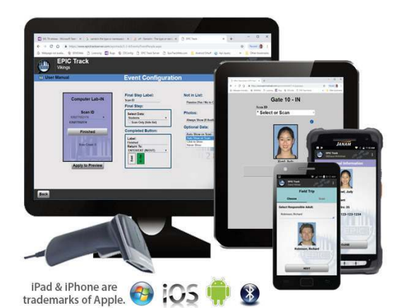
Multiple Tracking Devices Compatible with EPIC Track<sup>**</sup> - Including Smart Phones!

EPIC Track<sup>™</sup> is the perfect solution for K-12 School Districts to use when managing new school learning atmospheres supporting in-school and on-line learning. Expand your identification program by tracking student assets, temperature readings, and check in/out when entering a bus or school premises. Setup scanning stations 6' away from personnel or with mobile devices such as smartphones, tablets, handhelds or RPC at entrances.