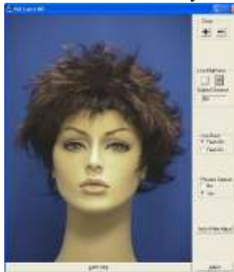
Zoom Set Correctly